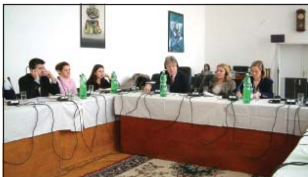
Regional Court Budget workshop in the Appellate Court - Shtip.

Initial budget negotiations between the Supreme Court and the Ministry of Finance indicate that the AO staffing request will be approved by the Government of Macedonia as part of a 20 percent budget increase to the Judiciary budget, tentatively approved over two budget years of 2004 - 2005.